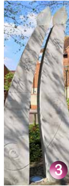
3: Abingdon A (Bews & Gorvin, 2005)

Tim Ward created this sculpture along with bespoke signs for the development of the Old Gaol in Abingdon. The octagonal shapes reference the old Napoleonic gaol in a contemporary and inviting way, in this public area, on the bank of the Thames.