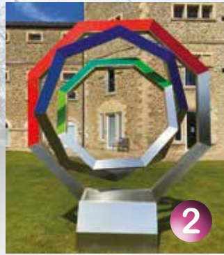
2: Octagon old gaol, Cranbourne homes (Tim Ward, 2015)

This stone spire topped with stainless steel is situated near the entrance to the Abbey Grounds. The spire represents the turned spire of the Anglo Saxon Church that stood on the site centuries before the Abbey was built. The steel cap acknowledges Abingdon's close link with modern technologies. Artist Michael Fairfax, designed the feature to celebrate the 450th anniversary of Abingdon's town charter.